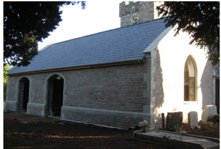
The scaffolding is down, and work has started on the renovation of the ground.