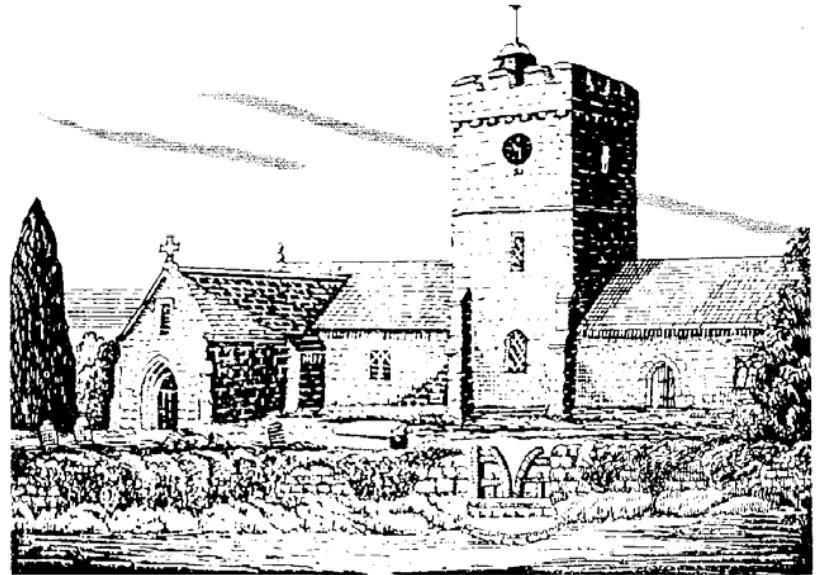
Parishes of Shirenewton and Newchurch