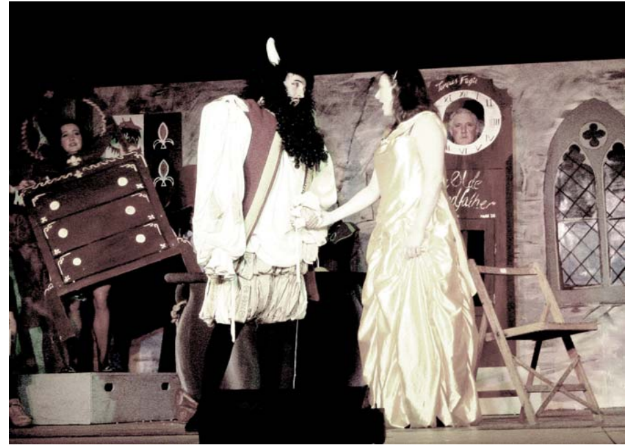
Beauty and her Beast & Our Next Generation of Stars