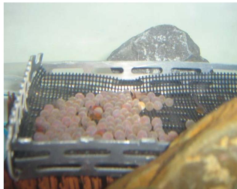
Some Trout Eggs